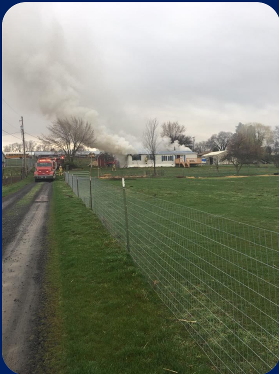
March 14 th , 2017 - Structure Fire at 45542 Mission Rd Pendleton, Oregon (Mutual Aid w/ Umatilla Tribal Fire Department)