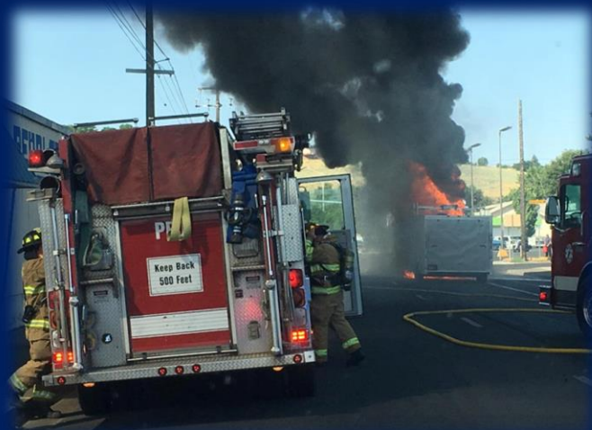
July 21 st , 2017- Motor Home Fire on SW Emigrant Ave. Pendleton, Oregon