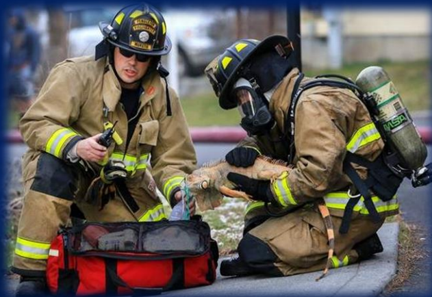
March 10 th , 2017- Structure Fire at 2600 SW Goodwin Ave. Pendleton, Oregon