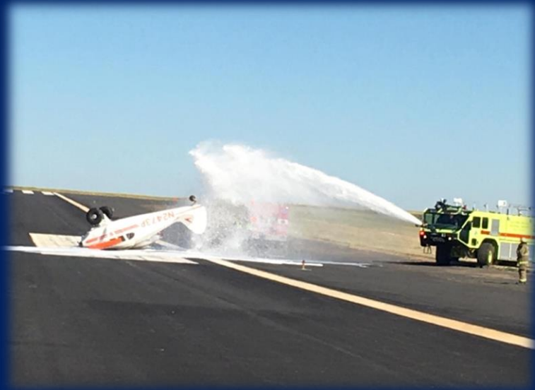
June 24 th , 2017- Plane Crash at Eastern Oregon Regional Airport. Pendleton, Oregon