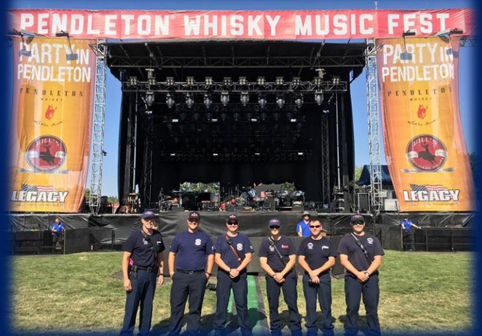
July 15 th , 2017- Whisky Fest Event. Pendleton Oregon