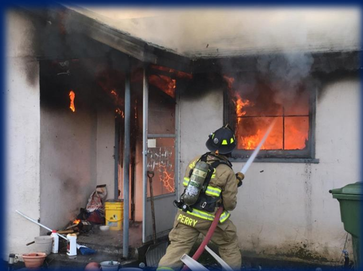
March 25 th , 2017 – Structure Fire at Unknown Address, Riverside Pendleton, Oregon