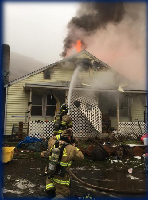
January 24 th , 2017- Structure Fire at 1525 SE Alexander Place Pendleton, Oregon