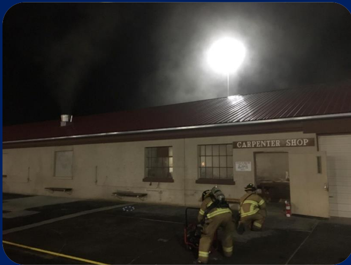
March 29 th , 2017- Structure Fires at Eastern Oregon Correctional Institution and NE Riverside Pendleton, Oregon.