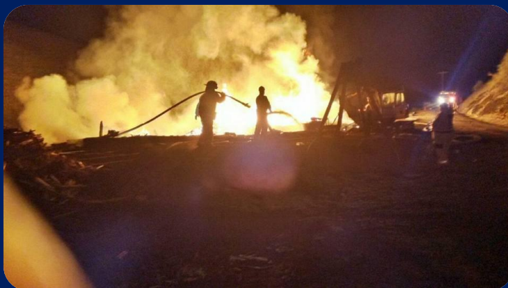
May 5 th , 2017- Wood Chipper Fire at 84501 Vansycle Rd. Helix, Oregon. (Mutual Aid w/ Helix and East Umatilla County Rural Fire Protection District)