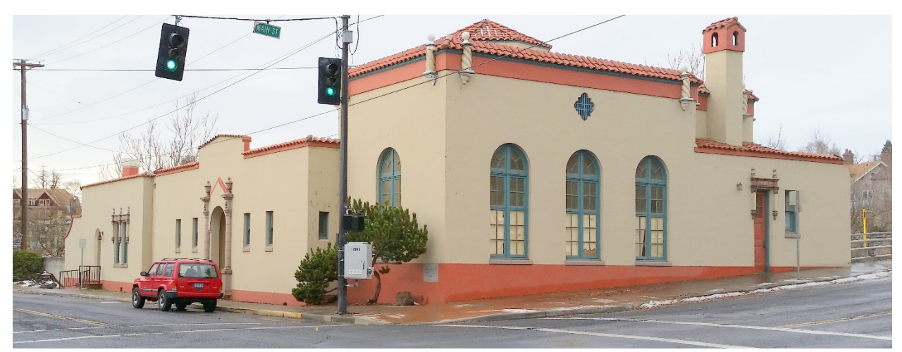
Southeast view of building at corner of S. Main Street and SW Byers Avenue