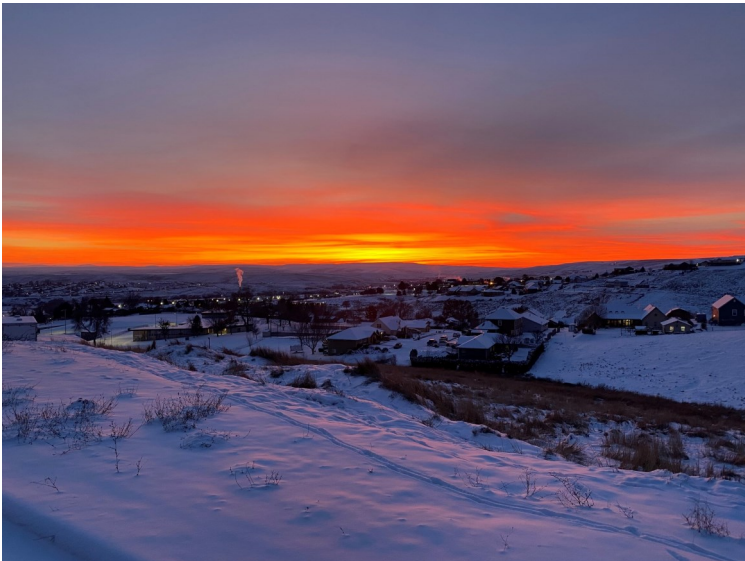
The sun sets over a snow-covered Pendleton in this Jan. 15, 2024 photo

Most of the winter weather procedures follow priority lists, which are available on the City of Pendleton website under Public Works Documents. Crews begin at the top of the first priority list and move down the list(s) as time and conditions allow. Crews from Public Works handle roads and publicly owned sidewalks, staircases, and parking lots; crews from Parks and Recreation handle walkways and roads in and around City Hall and City Parks, including roads at Olney Cemetery.