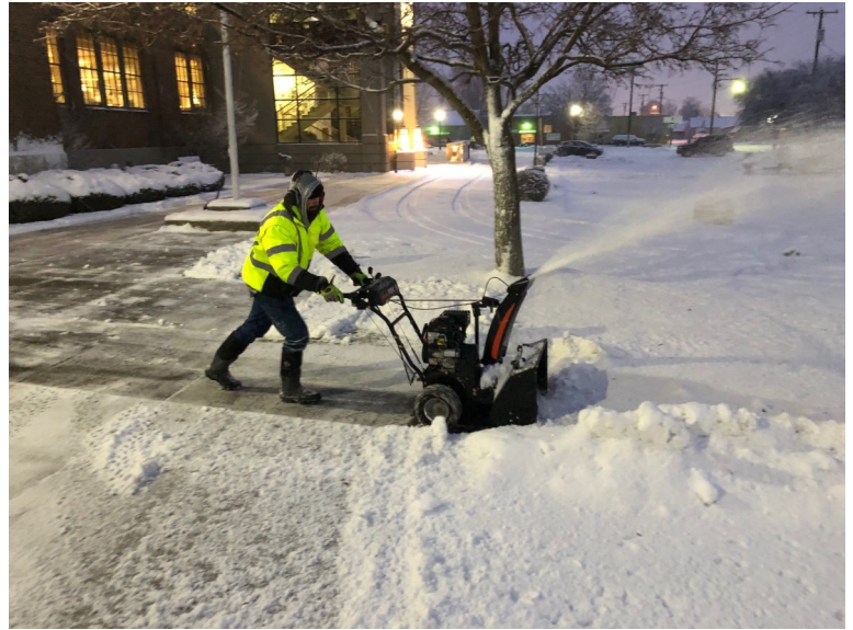
Crews from Pendleton Parks and Recreation and Pendleton Public Works shovel snow on city properties when the city sees winter weather

Between the two departments, snow and ice is removed from more than 50 walkways, bridges, and parking lots in Pendleton. On the roads side, there are 86 streets listed in Public Works’ three priority lists; the school priority list, used on school days and other days as requested by the district, adds an additional 29.