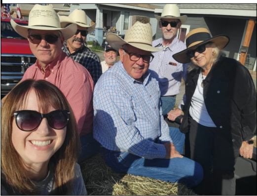
Participating in the Pendleton Round-Up Parades, Mayor Turner and City Council